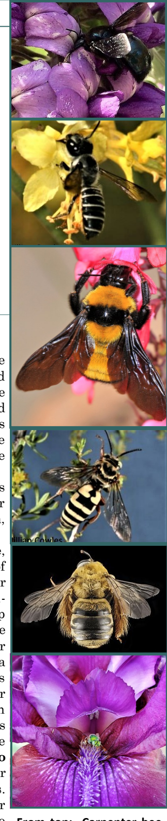
From top: Carpenter bee (Desert Museum blog), leaf-cutter bee (UA Bee Guide) Sonoran bumblebee (by Judy Gallagher), cuckoo bee (UA Bee Guide), squash and gourd bee (Wikimedia), sweat bee (Sue Clark, 2020)

Sources: "<u>The A Bee Cs of Arizona Bees</u>" by the Desert Museum, "<u>Arizona Bee Identification Guide</u>" by UA Extension Service (this one would be worth downloading and saving), Wikipedia articles: <u>Bee Lifecycles</u>, <u>Megachilidae</u>, and <u>Squash Bee</u>